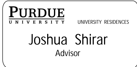
3 Lines & Logo