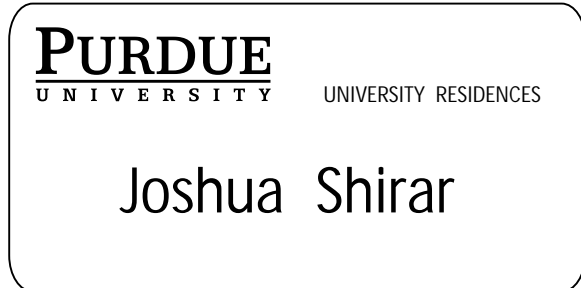
2 Line & Logo