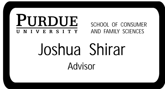
Example of badge with backplate